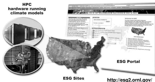
Figure 2: The Earth System Grid (ESG).

observations and model results and difference maps are produced for this evaluation.